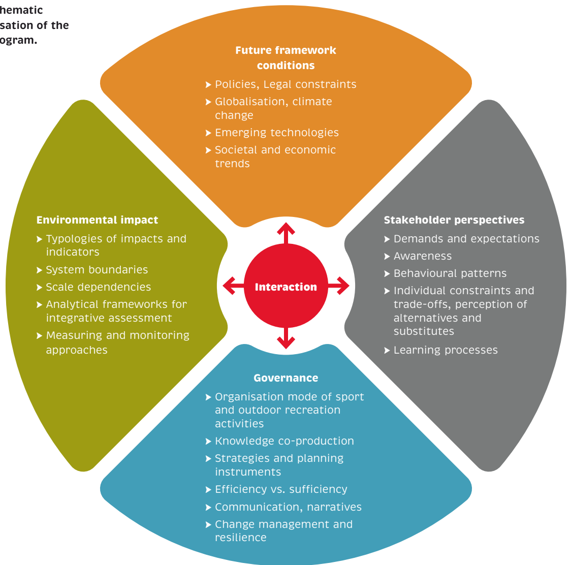
FIGURE 1. Thematic conceptualisation of the research program.